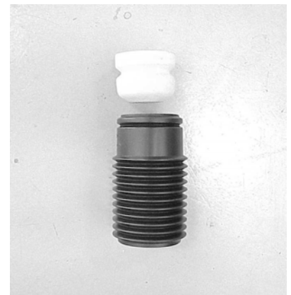
OE front bumpstop / Eibach boot