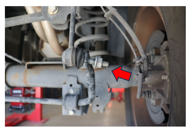
Loosen and remove OE rear end links from OE sway bar