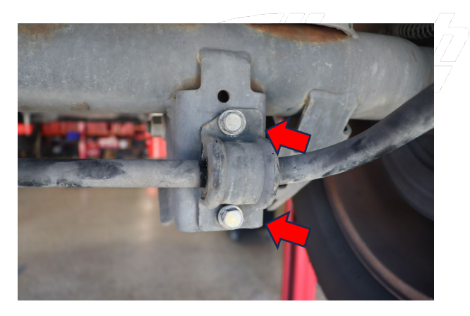
Loosen and remove OE sway bar brackets and remove sway bar.