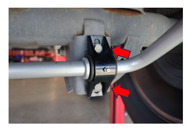
Install new bushings and brackets onto Eibach sway bar.