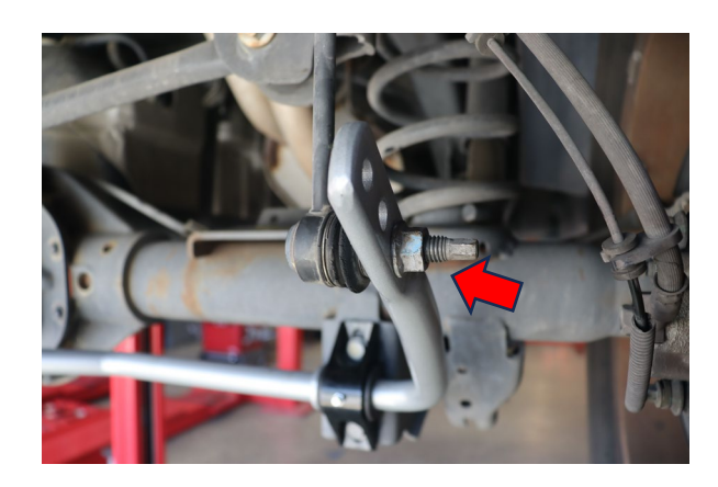
Attach factory end links to Eibach sway bar.

Be sure to lubricate inside of bushings before installation.