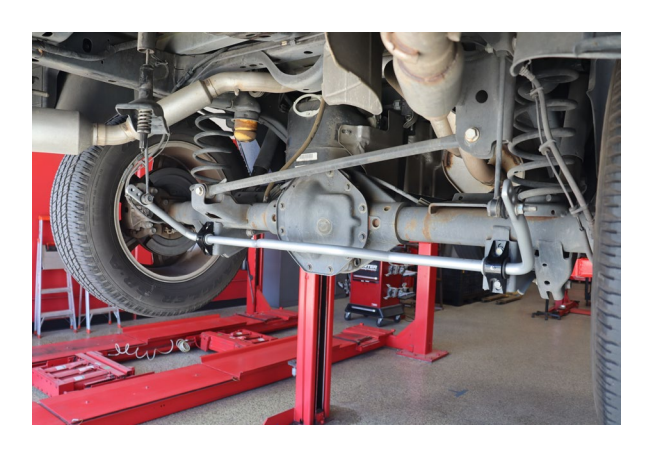
Double check to make sure everything is tight.

Be sure to lubricate inside of bushings before installation.