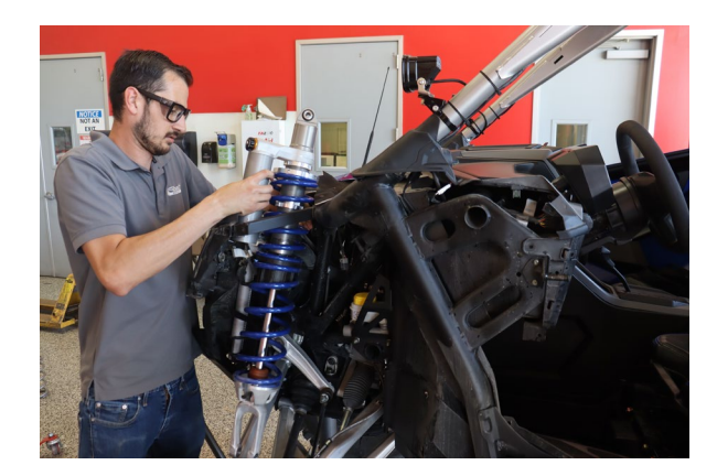
Pull the shock up through the top. It may help to twist the shock body first to align the reservoir with the opening.