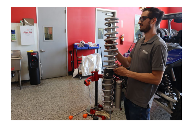
Install the Eibach rear main spring and compress the springs.