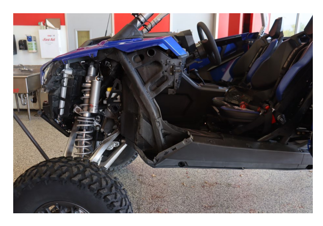
Repeat on the opposite side and reinstall everything the reverse order of removal.