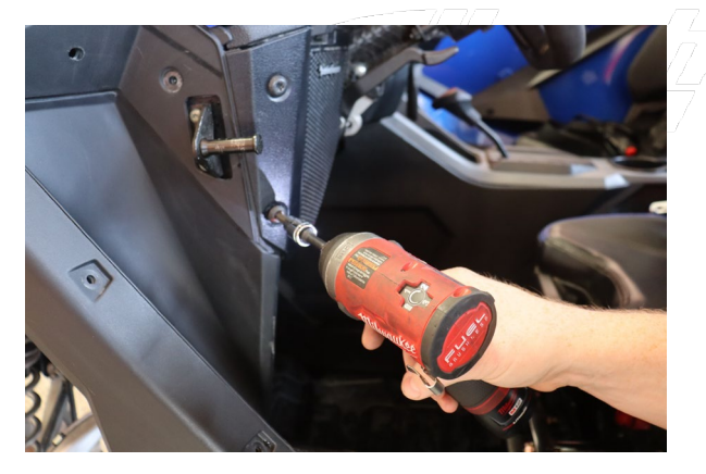
Remove the torx screws for the speaker grill