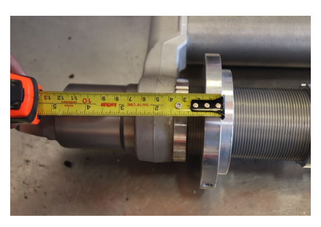
Set the preload collar to 35mm from the bottom of the Resi crossover to the bottom of the preload collar