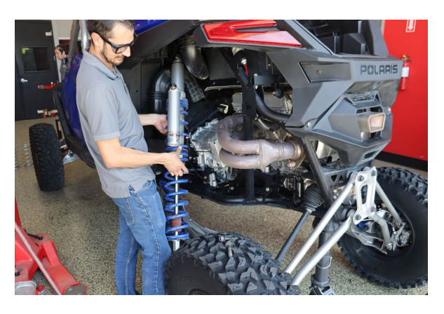
Remove the shock.