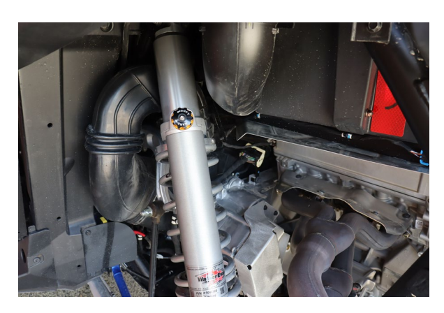
Set the rear adjuster 6 clicks clockwise from the full open (soft) position.