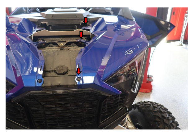
Remove the torx screws and clips securing the side hood fascia.