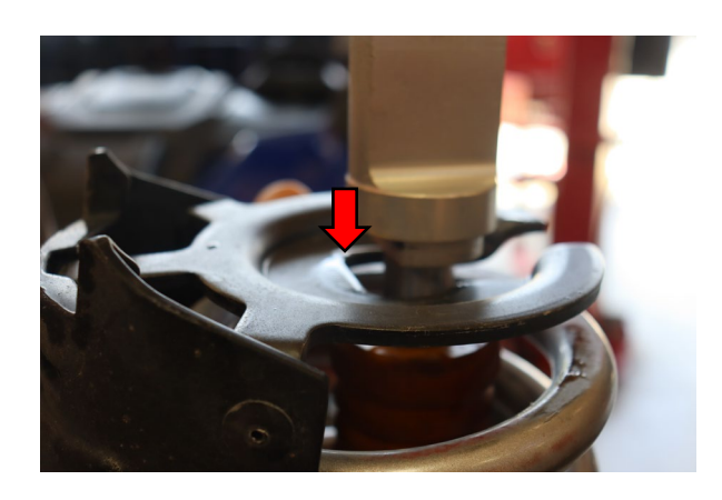
Install the OE lower spring perch and be sure to align the boss on the rod end.