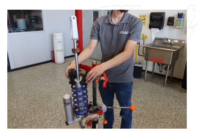
Remove the stock slider.