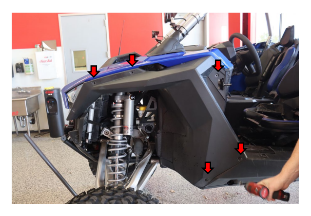
Remove all of the torx screws and clips on the fender.