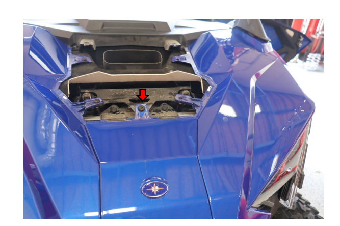
Remove the torx screw securing the front hood fascia. Push it toward the front of the car to release. For vehicles equipped with front camera unplug the harness.