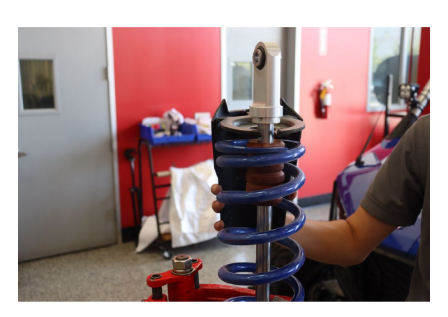
Compress the springs and remove the lower spring perch with the guard attached.