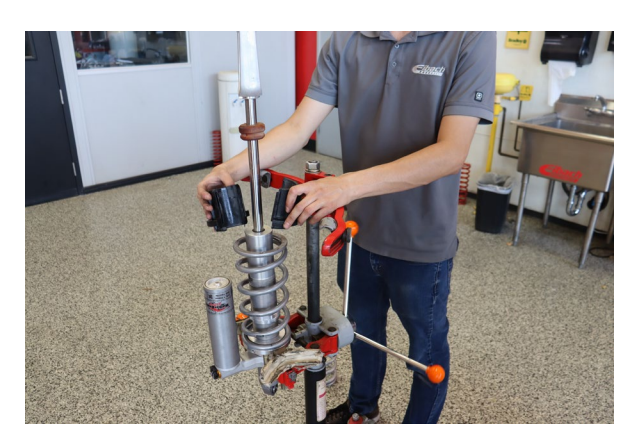
Install the OE 2-piece slider.