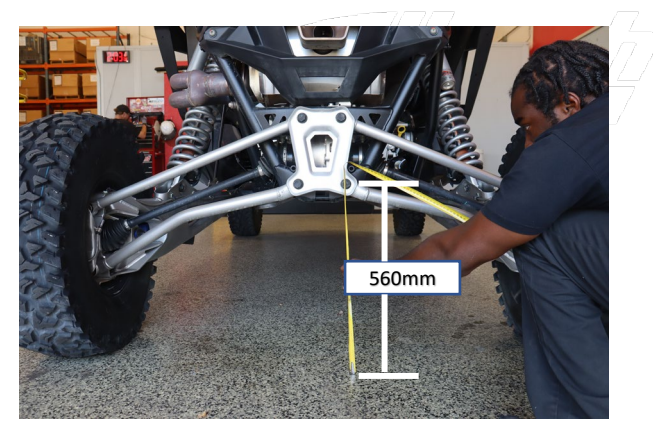
The rear ride height should be about 560mm with no extra weight on the vehicle. The rear eye to eye shock length should be about 965mm. These heights are measured without extra weight on the vehicle.