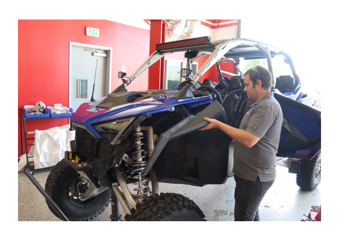
Remove the fender.