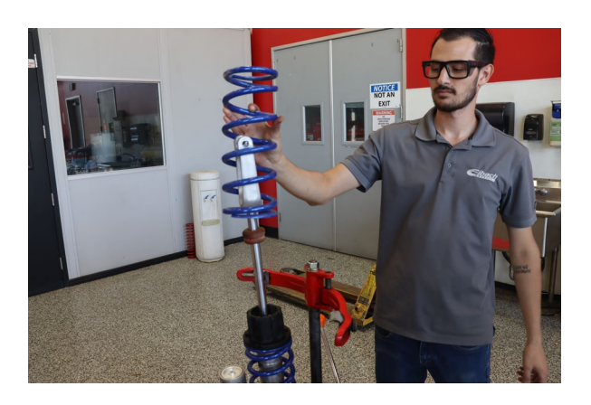
Remove the OE main spring.