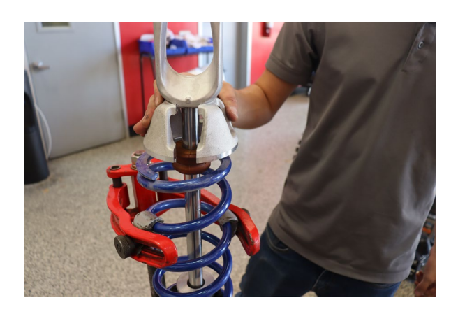
Compress the springs and remove the lower spring perch.