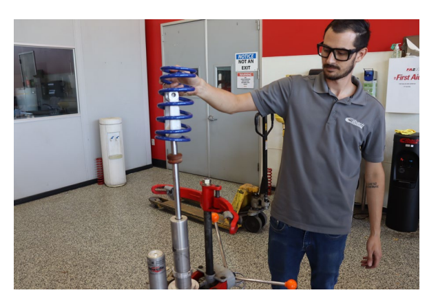
Remove the OE front tender spring.