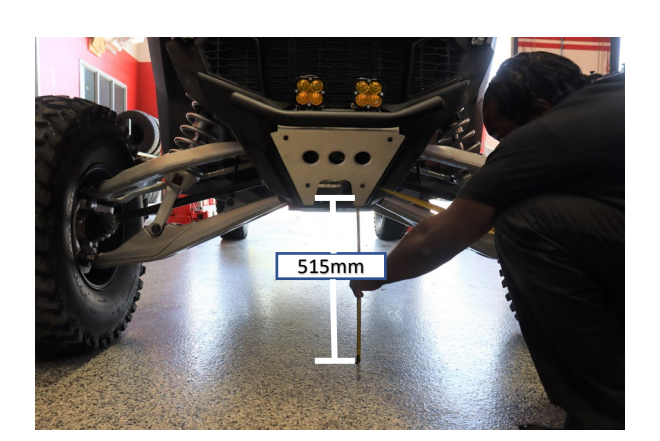
The front height should measure about 515mm from the ground to the lower control arm bolt. The shock eye to eye length should be about 795mm. These heights are measured without extra weight on the vehicle.