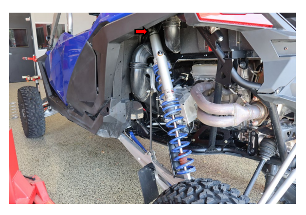
Jack up the rear of the car so the wheels are off the ground. Loosen and remove the upper shock bolt.