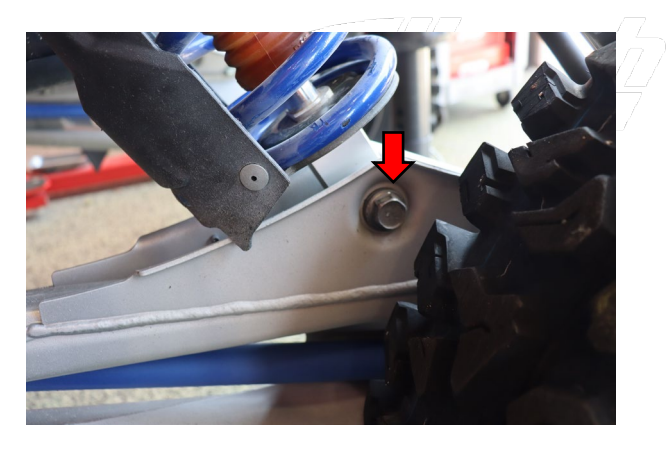
Loosen and remove the lower shock bolt