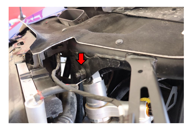
With everything removed and the car jacked up with the front wheels off the ground. Remove the upper and lower shock bolts.