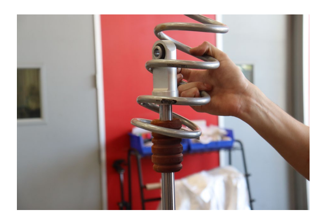
Install the Eibach rear tender spring.