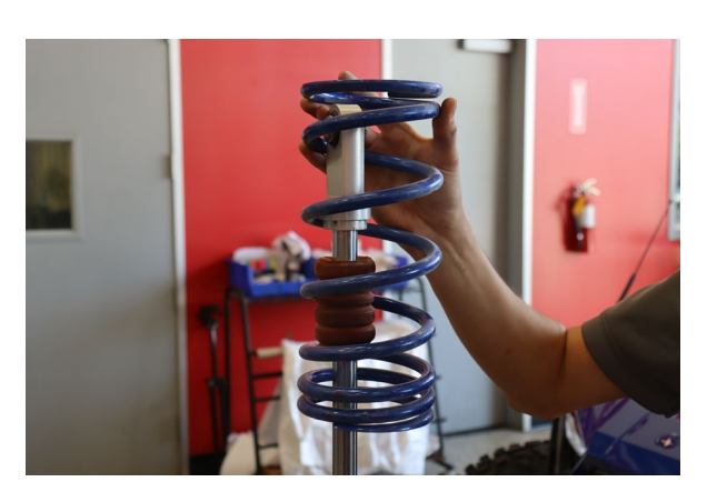
Remove the OE rear tender spring.