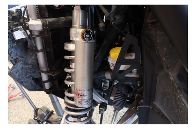
Set the adjuster to 7 clicks clockwise from the full open (soft) position.