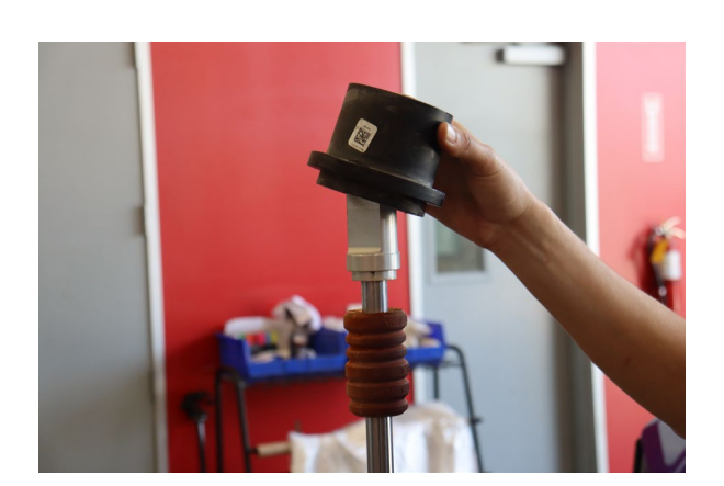
Install the OE slider.