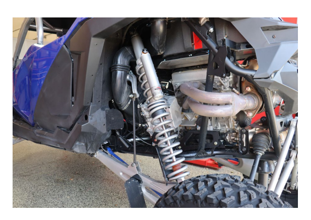
Reinstall the shock and repeat on the other side.