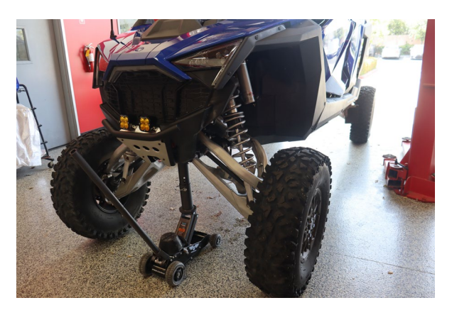
Begin by jacking up the front of the vehicle.