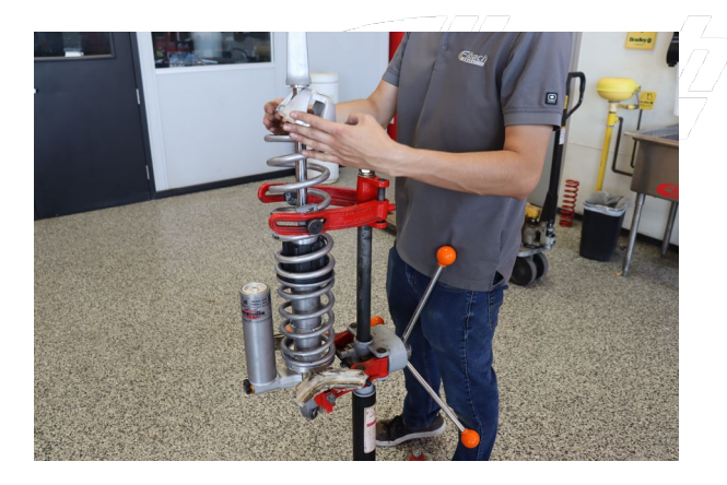
Install the Eibach main spring and the OE lower spring perch. Make sure the perch is lined up with the boss on the clevis.