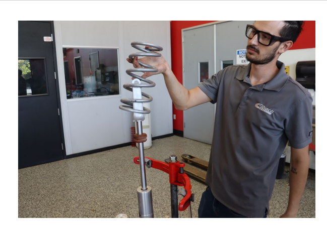
Install the Eibach Front Tender.