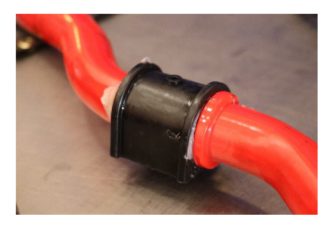
11. Install the bushings to the outside of the ring.