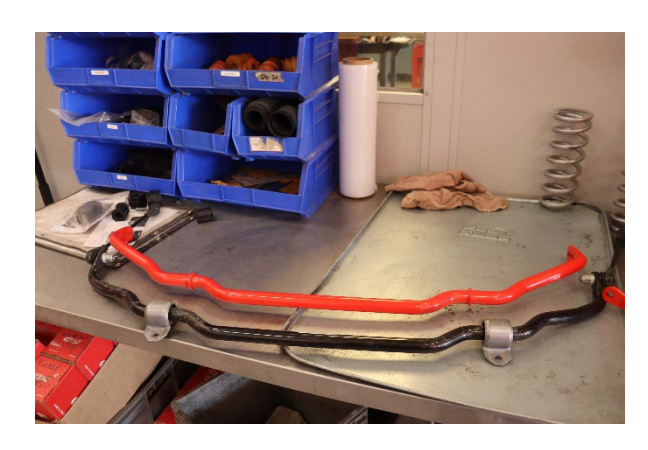
6. Confirm the orientation of the Anti Roll bar with the OE bar.