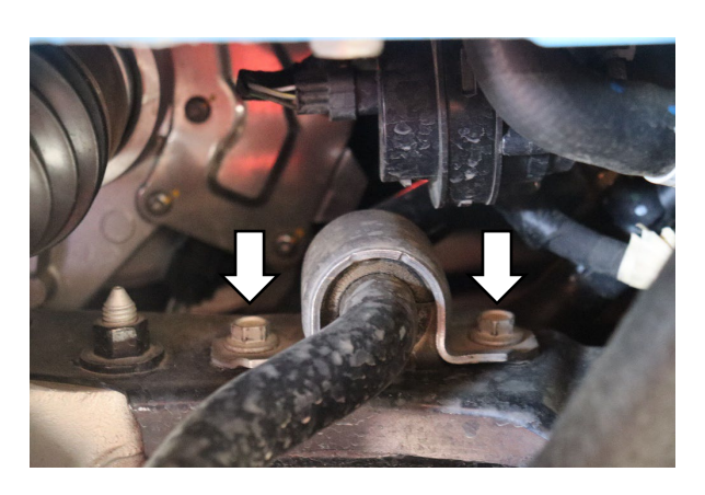
4. Remove the two bolts that secure the OE bar with a 15mm socket.