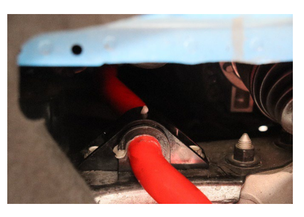
13. With the bar in the proper position install the provided brackets and secure them with the OE hardware using a 15mm socket.