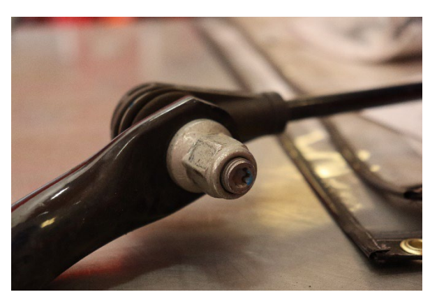
7. Remove the end link from the bar with a 15mm wrench