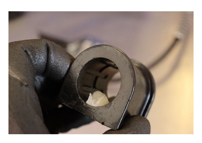
10. Apply the lubricant to the bushing