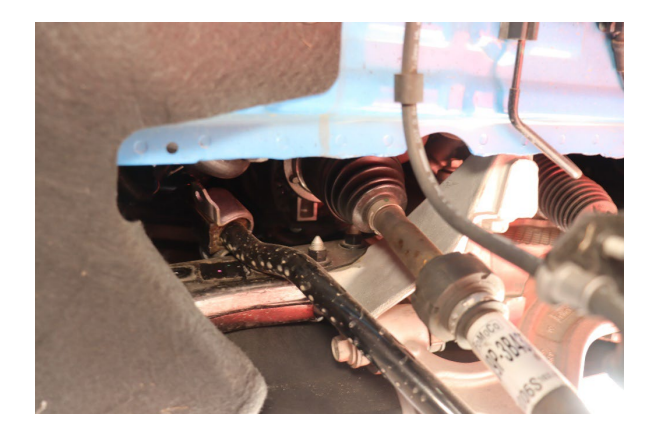
5. Remove the OE bar from the driver side of the vehicle.