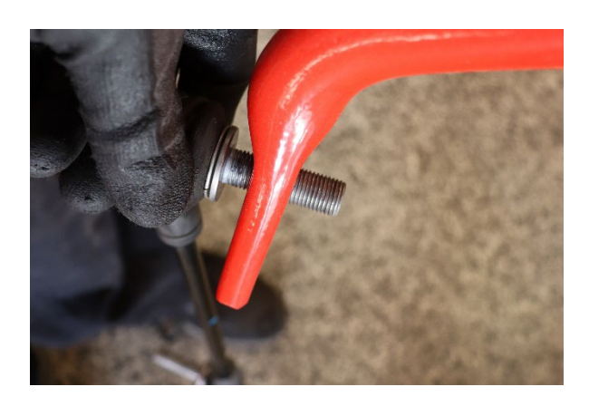
9. Attach the end links to the sway bar.

Stiffest: Reduces oversteer Softest: Reduces understeer