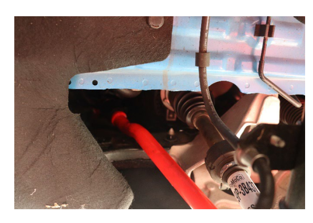
12. Install the bar with the end links and bushings installed.