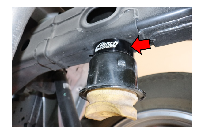
Install the provided bump stop spacer with the provided bolt.

2 different bolts are provided depending on the exact vehicle configuration. Use the bolt that provides the necessary threads with the spacer installed.