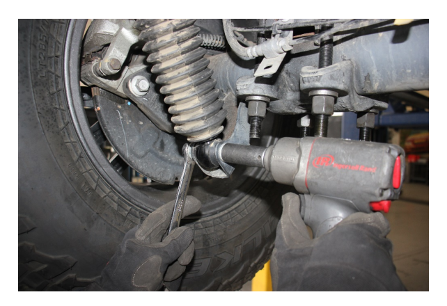
Reinstall the lower shock bolt.

2 different bolts are provided depending on the exact vehicle configuration. Use the bolt that provides the necessary threads with the spacer installed.