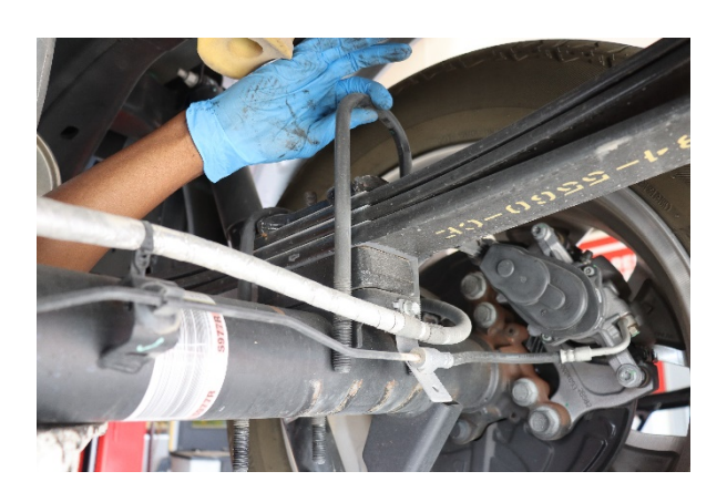
Remove the OE u-bolts.