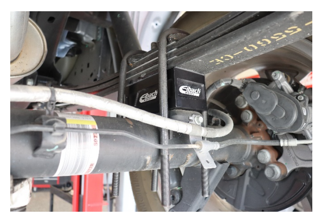
Raise the axle back up so the pins are fully seated on the top and bottom of the block and then reinstall the provided u-bolts.

The axle may shift to one side when raising and lowering so this may require leverage or a pry bar to help guide the pins make into place.