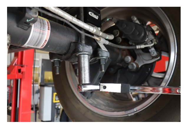
Tighten the u-bolts to 100 ft-lbs in a cross pattern shown to the right.