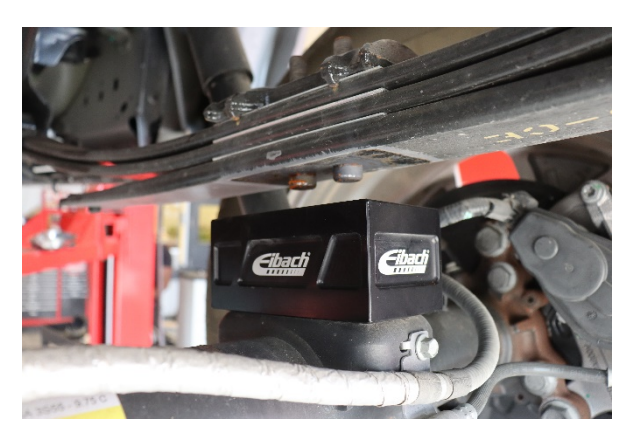
Install the new Eibach lift block.