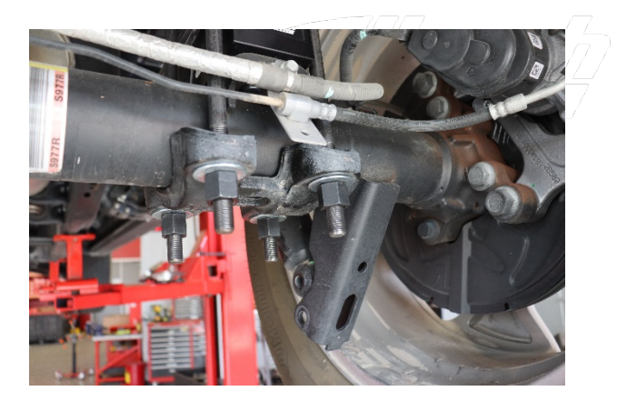
Reinstall the axle carrier and hand tighten the nuts equally before tightening with a wrench.

The axle may shift to one side when raising and lowering so this may require leverage or a pry bar to help guide the pins make into place.