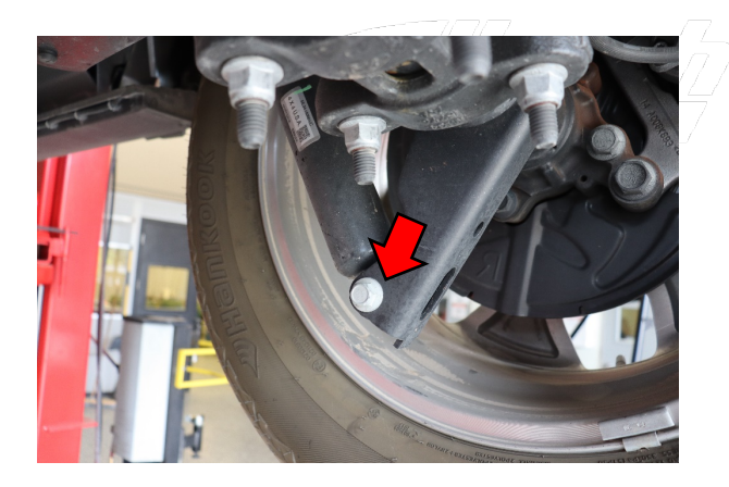
Loosen and remove the lower shock bolt.