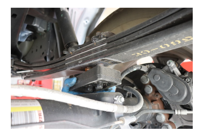
Lower the axle and remove the OE block. Make sure any brake lines or wires do not overstretch when lowering the axle.