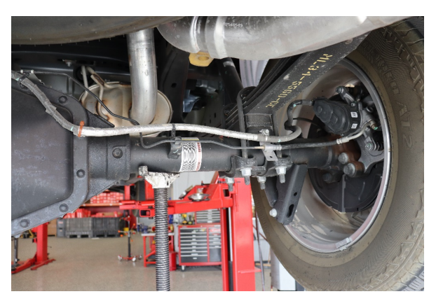
Before beginning make sure the axle is properly supported with a jack.