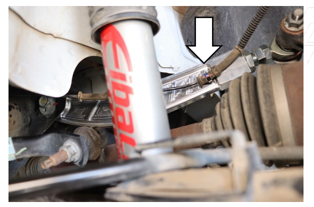
Step 3. Reinstall the wheel speed sensor wiring to the camber arm.

Reinstall the two 15mm bolts and torque nuts to manufacturer's spec.