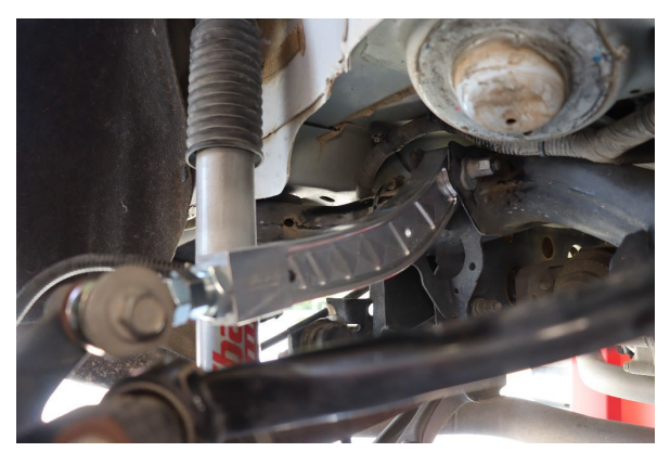
Step 2. Make sure that the adjustable arm is the same length eye hole to eye hole as the stock arm.

Reinstall the two 15mm bolts and torque nuts to manufacturer's spec.