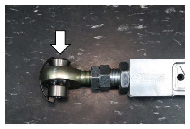
Before installing ensure that the tapered heim spacer is facing the knuckle of the vehicle.

Note: Be sure to remove the wheel speed sensor wire