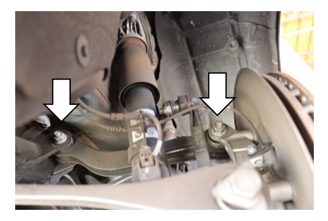
With the spring removed, you can now remove the two 18mm bolts for the OE camber arm.