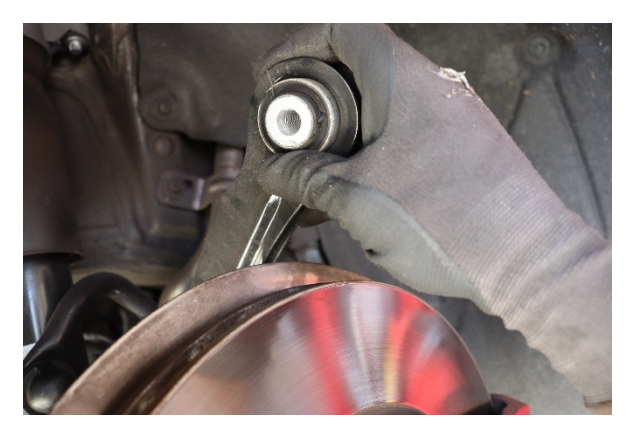
Remove the OE camber arm.