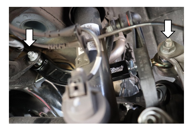
Install Eibach Camber Arm with the OE 18mm bolts.