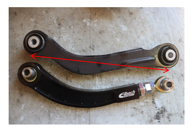
Set the Eibach Camber Arm to the same length as the OE camber arm before installation. Lock the jam nuts in positions once at the correct length. (This will be adjusted again later on an alignment rack.)

It is important to adjust only from the center adjuster nut so the threads remain even!