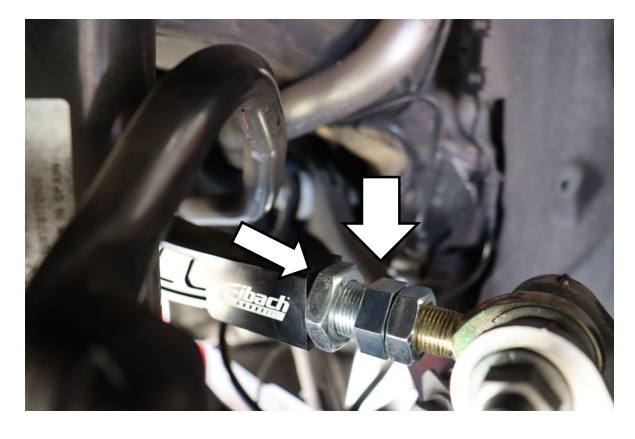
When adjusting the rear camber loosen the 24mm and 29mm jam nuts to adjust the rear camber of the vehicle. When the desired result is achieved lock the jam nuts back in place.

When tightening the jam nuts make sure the heim joints are as straight as possible to allow for maximum articulation and preventing binding