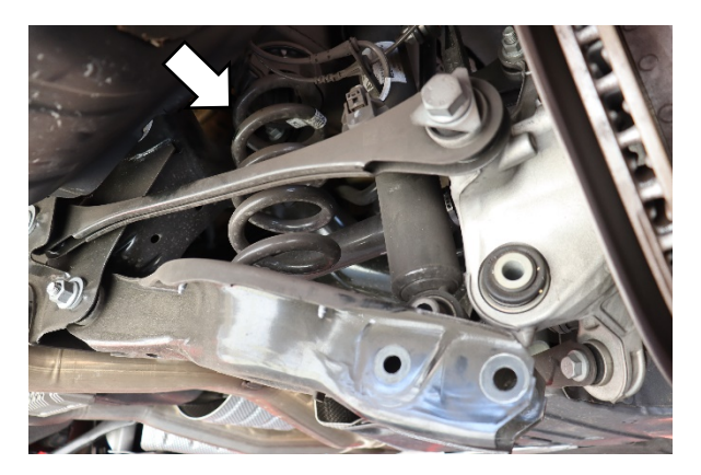
You can now pull down on the lower control arm and remove the spring.