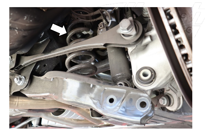
Reinstall the spring and support the lower control arm with a jack % \left( {{{\rm{A}}_{\rm{B}}}} \right)