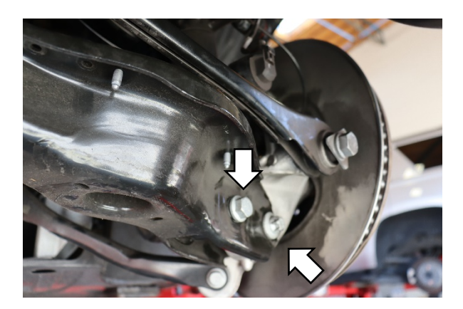
Reinstall the E20 and 18mm bolts for the lower control arm.