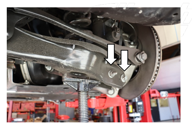
Support the lower control arm with a jack, then, remove the E20 bolt and 18mm nut. With the bolts completely removed lower the lower control arm.