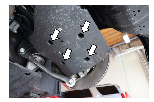
Reinstall the four 10mm nuts for the lower control arm cover