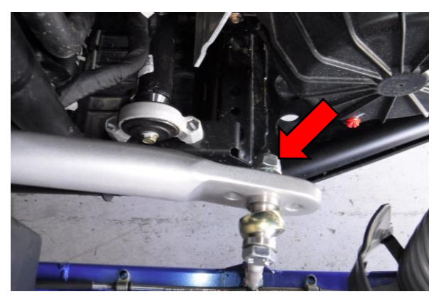
Step 11 Step 11.