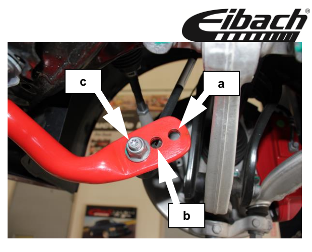
Tuning the Front Bar.