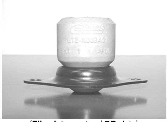
(Eibach bumpstop / OE plate)

3. Install the new Eibach bumpstop in the OE mounting plate, and reinstall in the car.