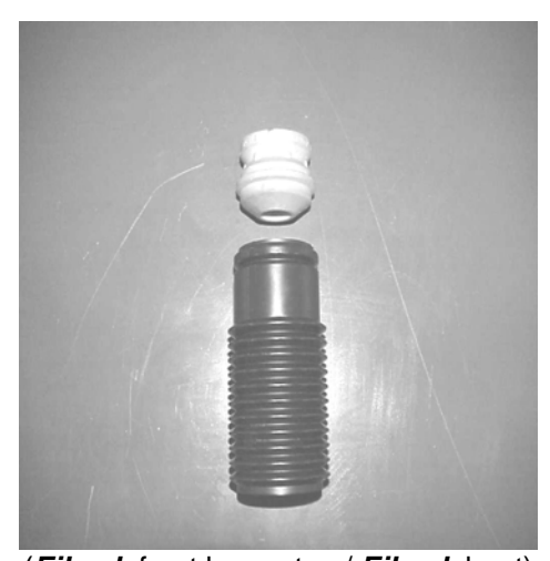
(Eibach front bumpstop / Eibach boot)

2. Snap new Eibach boots onto new Eibach bumpstops and reinstall in the same fashion as the factory parts on the front strut assemblies.