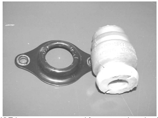
( OE bumpstop separated from mounting plate)

2. Remove and discard the OE bumpstop, retain the mounting plate.