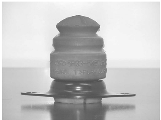
(OE rear bumpstop and plate)

1. Remove the factory bumpstop and plate from the rear axle.