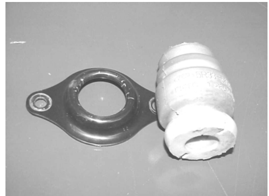
(OE bumpstop separated from mounting plate)