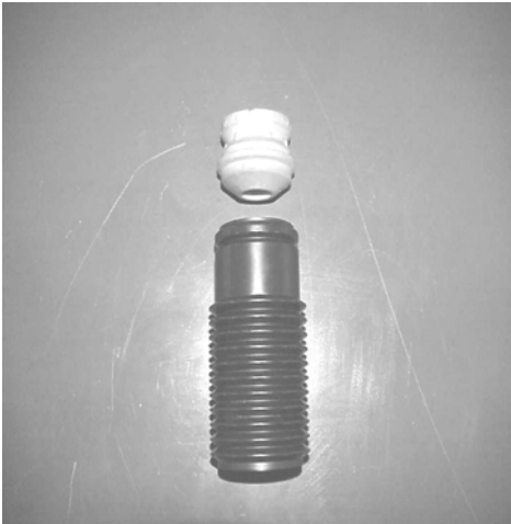
(Eibach front bumpstop / Eibach boot)