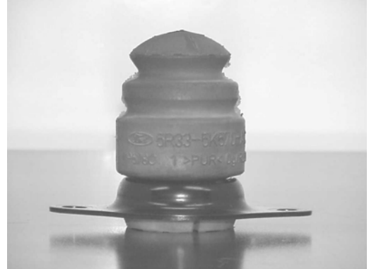
(OE rear bumpstop and plate)