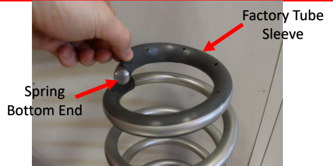
Install Factory Tube Sleeve on bottom of Eibach Lift Spring as shown above.