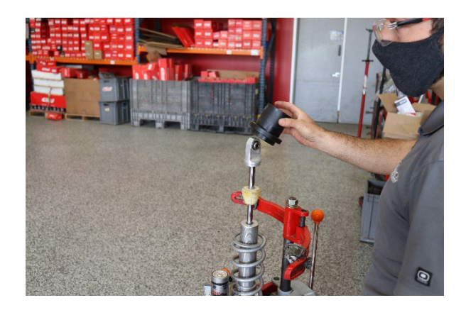
Step 11. Install the Eibach spring slider (8001100).