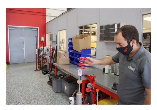
Step 7. Remove OE secondary spring.