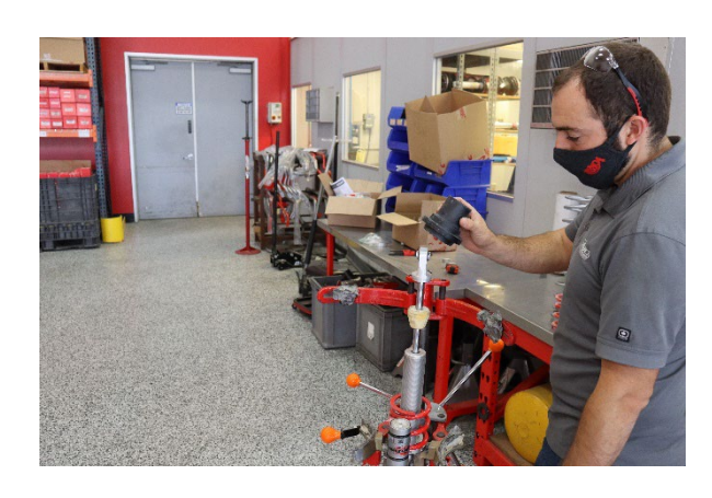
Step 6. Remove OE spring slider.