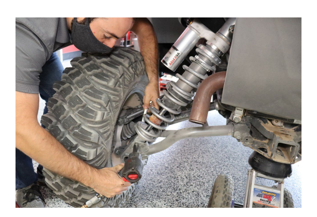
Step 16. Secure the coilover to the control arm with the OE hardware.