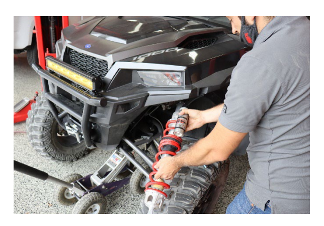
Step 3. Remove the coilover.