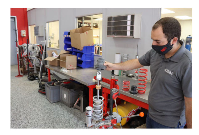
Step 11. Install the Eibach spring slider (8001498).