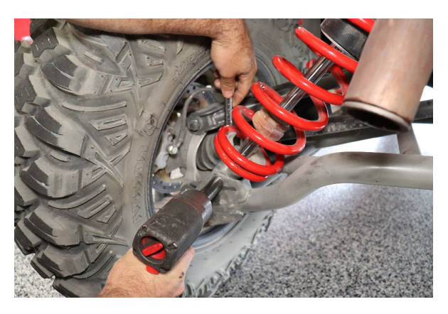
Step 1. Raise the rear of the vehicle and support it with the proper safety equipment. Loosen and remove the hardware that secures the coilover to the control arm. Note: Never work on or under a vehicle that is not supported by the proper safety equipment.