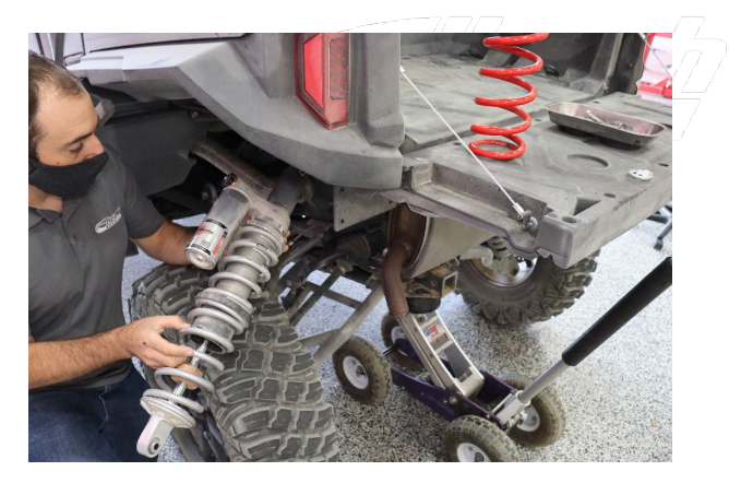
Step 14. Reinstall the coil over.