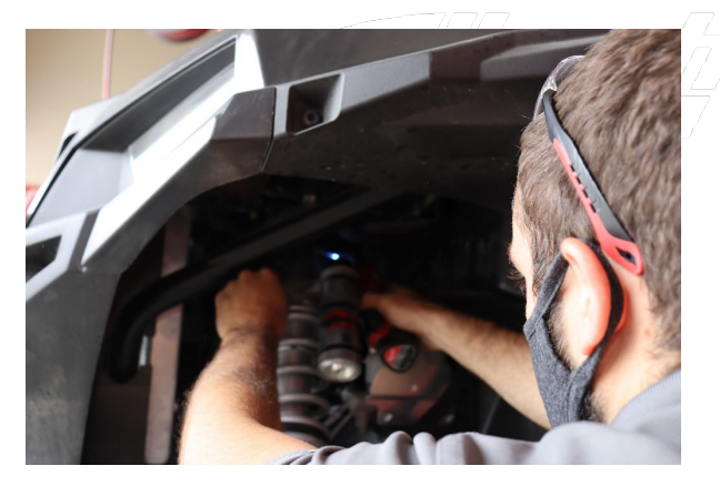
Step 14. Reinstall the coil over. Secure the coilover to the upper mount with the OE hardware.