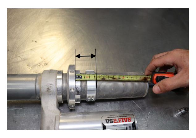
Step 9. Install the cross-over rings (8001063) and set them at 45mm measuring from the spring flange to the bottom of the crossover ring.