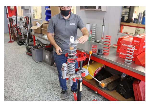
Step 13. Compress the spring assembly and reinstall the spring retainer.