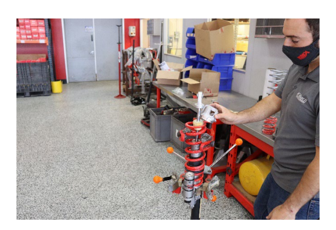
Step 4. Compress the coilover, then remove the spring retainer. Note: The bump stop will need to be pried down, out of the way of the spring retainer.