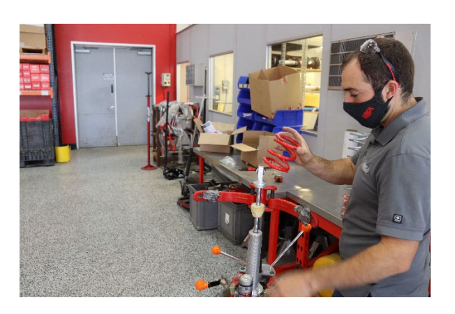
Step 7. Remove OE secondary spring.