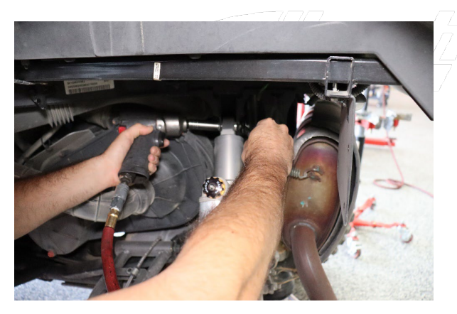
Step 2. Loosen and remove the hardware that secures the coilover to the upper mount.