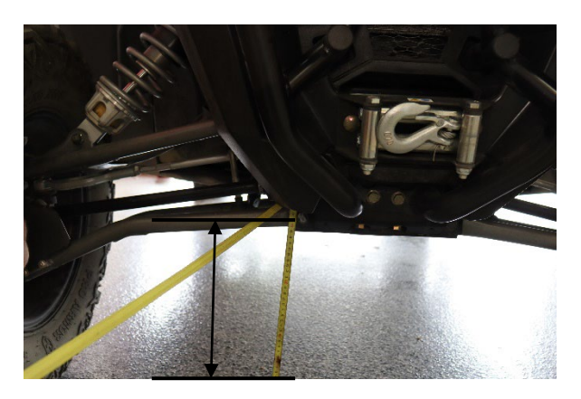
Step 16. Measure from the ground to the center of the lower control arm bolt. The recommended preload measurement in Step 8 will get the vehicle close to the recommended ride height but each vehicle may vary some. We recommend setting the ride height at 415mm measuring from the ground to the center of the lower control arm bolt. Note: If you have larger than stock wheels and tires, the ride height will be increased. Due to the sensitivity of weight on these vehicles, preload may need to be adjusted to get to recommended ride height.