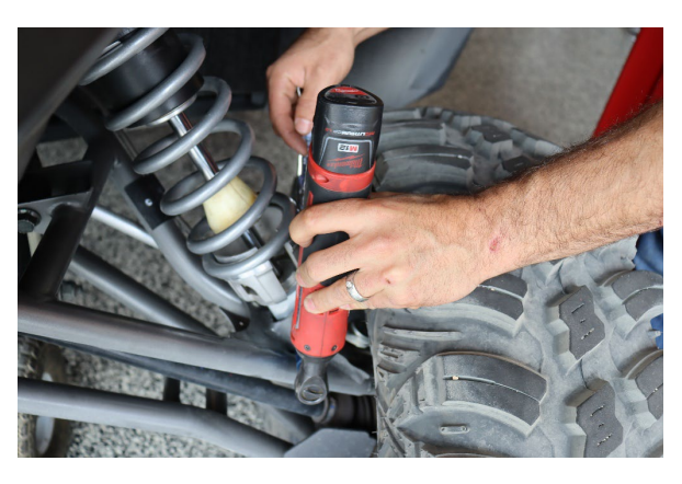
Step 15. Secure the coilover to the control arm with the OE hardware.