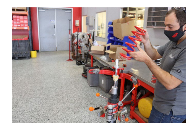
Step 5. Remove OE main spring.