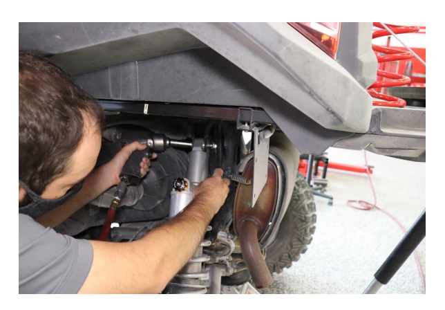
Step 15. Secure the coilover to the upper mount with the OE hardware.