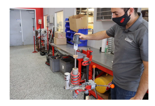
Step 6. Remove OE spring slider.