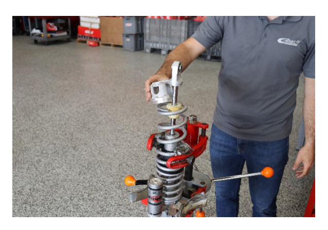
Step 13. Compress the spring assembly and reinstall the spring retainer.