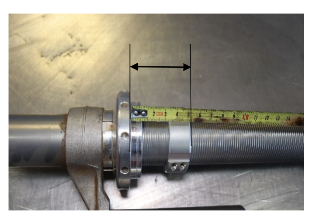
Step 9. Install the cross-over rings (8001224) and set them at 50mm measuring from the spring flange to the bottom of the crossover ring.