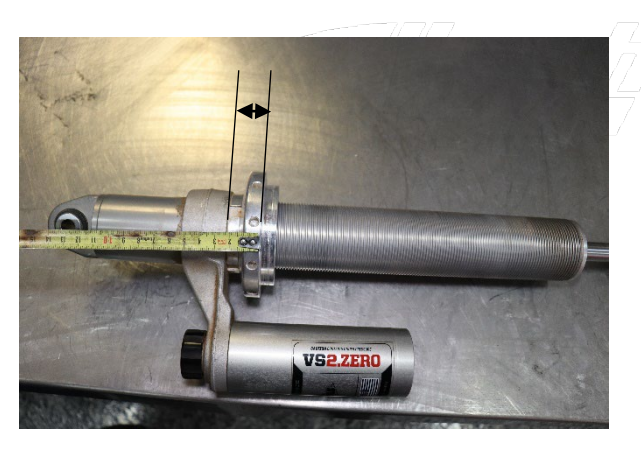
Step 8. Set the preload collar to \bf 25mm (FULL HIGH) measuring from the base of the reservoir housing to the spring flange.