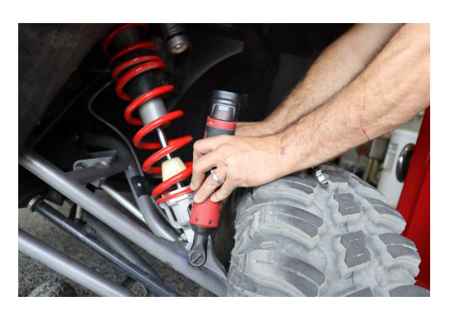
Step 1. Raise the front of the vehicle and support it with the proper safety equipment. Loosen and remove the hardware that secures the coilover to the control arm. Note: Never work on or under a vehicle that is not supported by the proper safety equipment.