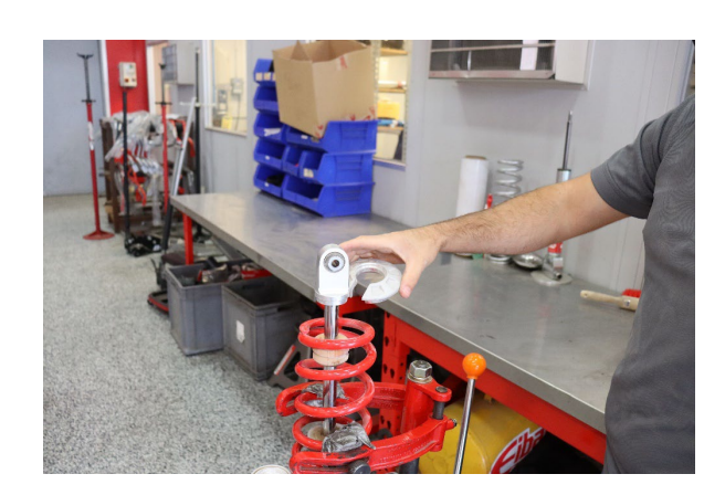
Step 4. Compress the coilover, then remove the spring retainer. Note: The bump stop will need to be pried down, out of the way of the spring retainer.