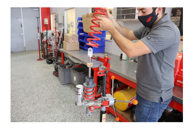
Step 5. Remove OE main spring.