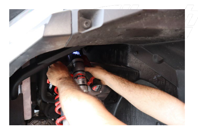
Step 2. Loosen and remove the hardware that secures the coilover to the upper mount.