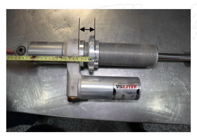
Step 8. Set the preload collar to 40mm measuring from the base of the reservoir housing to the spring flange.