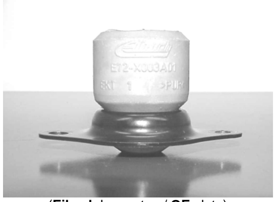
(Eibach bumpstop / OE plate)

3. Install the new Eibach bumpstop in the OE mounting plate, and reinstall in the car.