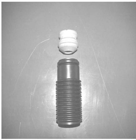
( Eibach front bumpstop / Eibach boot)

2. Snap new Eibach boots onto new Eibach bumpstops and reinstall in the same fashion as the factory parts on the front strut assemblies.