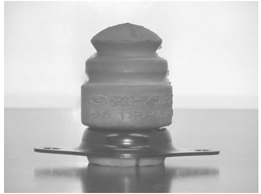
(OE rear bumpstop and plate)

1. Remove the factory bumpstop and plate from the rear axle.