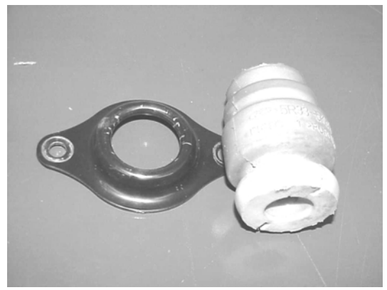
( OE bumpstop separated from mounting plate)

2. Remove and discard the OE bumpstop, retain the mounting plate.